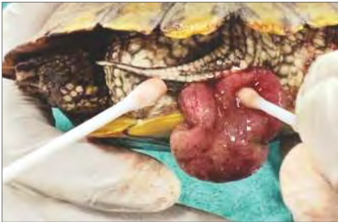
Fig. 3. Repositioning of phallus