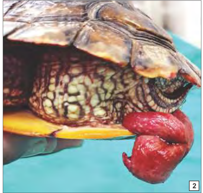
Figs. 1-2. Prolapsed phallus