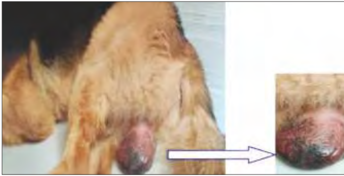
Fig. 1. German shepherd dog showing unilateral Orchi-epididymitis confirmed by complete blood picture (normal levels of neutrophil and leukocyte count) and was re-examined by ultrasonography on 15 th day of antibiotic therapy where both testes showed normal testicular size and did not reveal any abnormalities.

In conclusion, orchiepididymitis with E. Coli infection presented in German shepherd dog was diagnosed clinically and successfully treated with antibiotics Nitrofurantoin and Ceftriaxone without any complications.