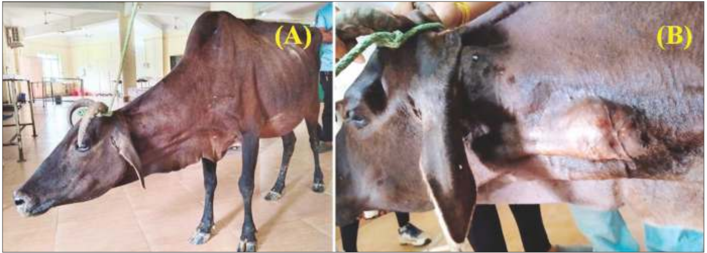
Fig. 1. (A) Animal showing sign of discomfort with extended neck and (B) Solid round movable mass at mid cervical oesophageal region