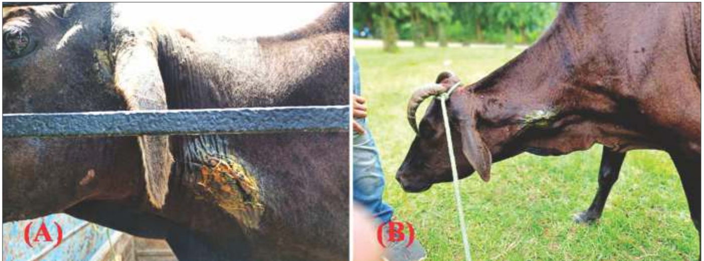
Fig. 3. (A) Skin suture and (B) Post-operative antiseptic dressing

(2000) and stated that the obstruction could be relieved easily if the obstruction is in the cervical region. Sreenu and Sureshkumar (2001) also reported successful surgical management of oesophageal obstruction by tarpaulin cloth in a buffalo calf which corresponded with the present case