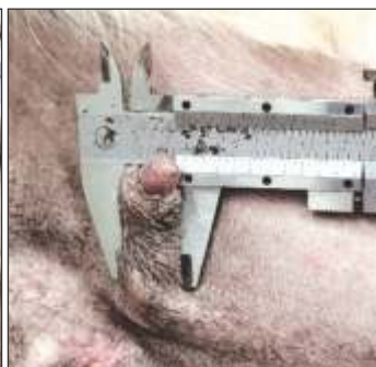
Fig. 10. Day 30

shown in Table 2. In Group III, the fluctuations were statistically insignificant.