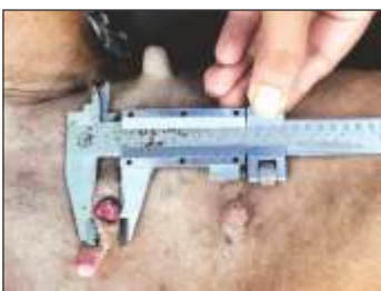
Fig. 5. Day 14