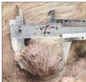
Fig. 7. Day 0