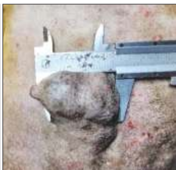
Fig. 8. Day 7