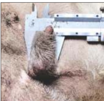
Fig. 9. Day 14