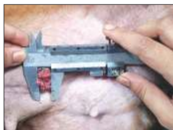
Fig. 3. Day 0