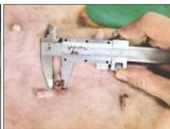
Fig. 6. Day 30