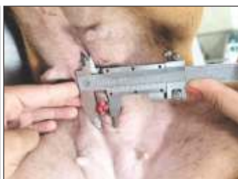
Fig. 4. Day 7