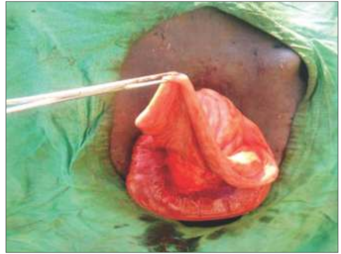
Fig. 1b. After resection of fibrous band to relieve intestinal obstruction

10 th post-operative day. The animal recovered uneventfully without any post-operative complication and as per telephonic records is living a healthy life.