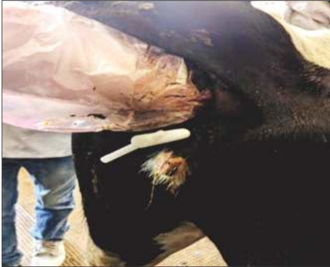
Fig. 1. Fincher's Test (HF Heifer 1, Vaginal length 13 cm)