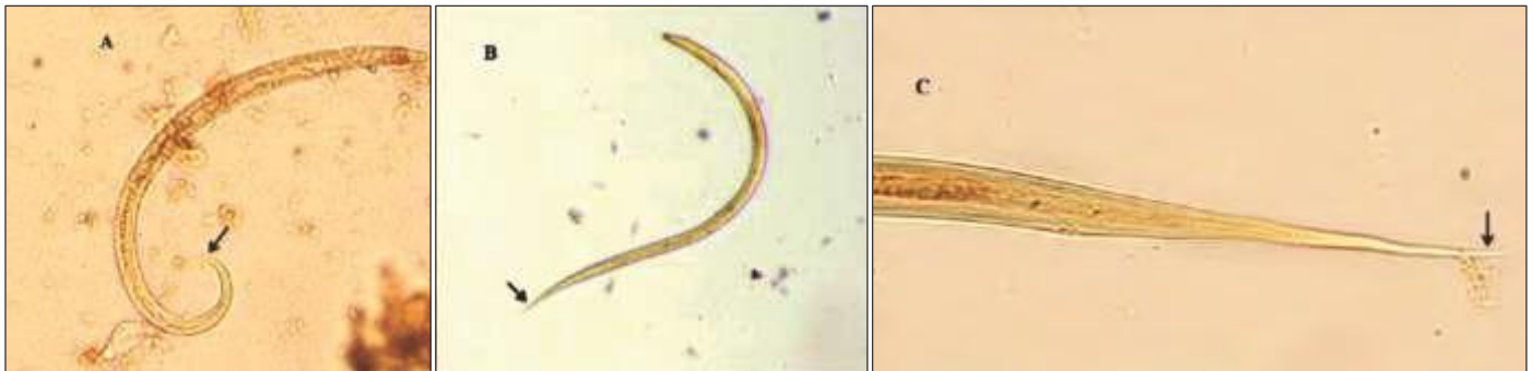
Fig. 2. Microphotographs (10 x) of different strongyle larva recovered by coproculture: (A) Haemonchus contortus , (B) Trichostrongylus spp. (C) Oesophagostomum spp.