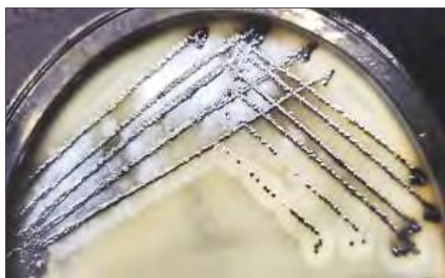
Fig.1. Black colour colonies of Clostridium perfringens on Perfringens agar base with Tryptose Sulphite Cycloserine (TSC) supplements