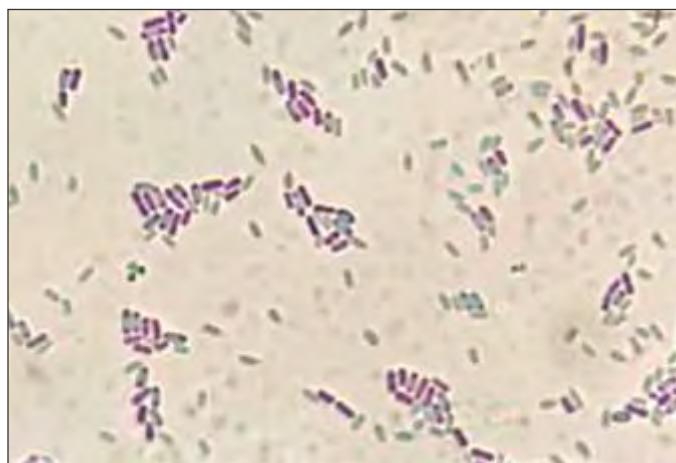
Fig.2. Spore of Clostridium perfringens in green colour by Schaeffer and Fulton staining method

perfringens by overlaid technique described by Sengupta et al. (2011). Sets of triplicate plates for each dilution were incubated anaerobically at 37° C for 24 hours and observed for black colored colonies on the TSC media plates. The