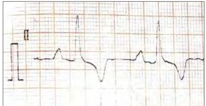
Fig. 3. Electrocardiographic image of infected dog

baseline in the ST segment or curved terminal upstroke of S wave or displacement of the ST segment in the opposite direction of QRS deflection, ST coving associated with endocardial ischaemic changes (Sahoo et al. , 2021; Gowtham et al. , 2022). The present data of the study indicates that canine babesiosis can affect the cardiac tissues resulting in ECG changes.