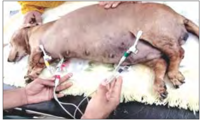
Fig. 2. Babesiosis in Dachshund female dog