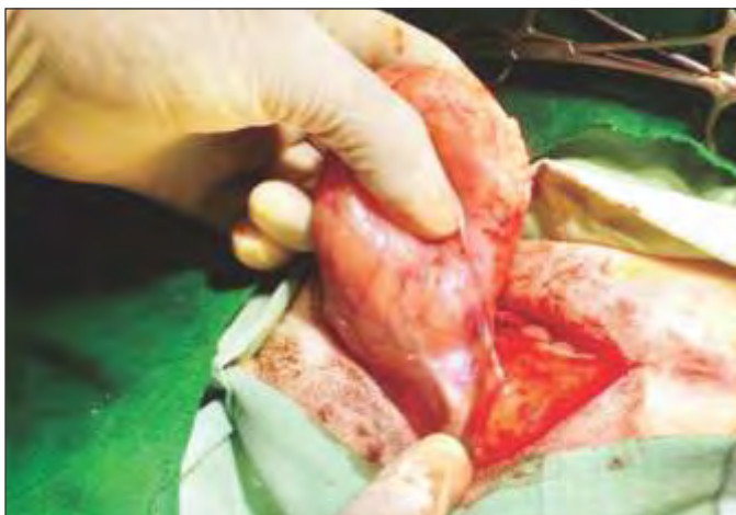
Fig. 4. Herniated sac in left inguinal region of spitz bitch