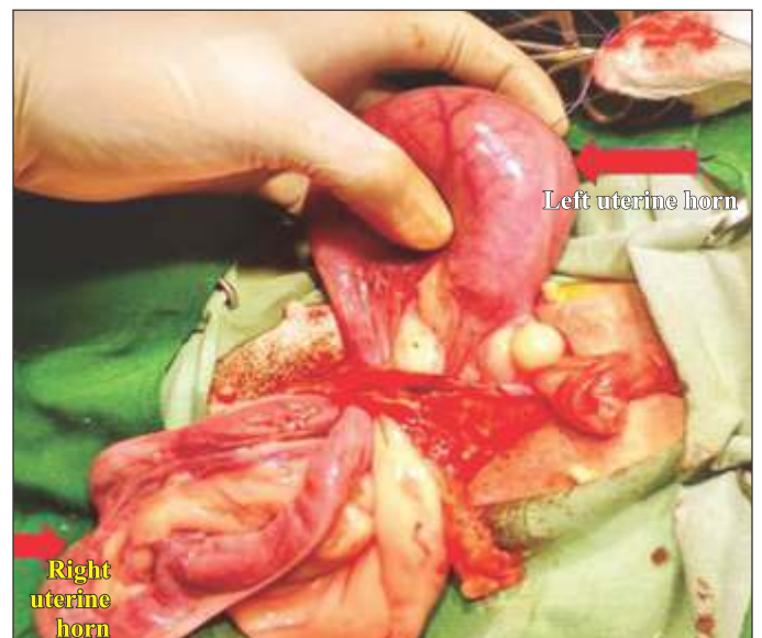
Fig. 5. Dissection of hernial sac showed left uterine horn distended with fluid while right uterine horn appeared normal in the abdomen of Spitz bitch