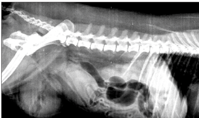
Fig. 2. Lateral radiographic view of the abdomen demonstrates radiopaque content of herniated mass