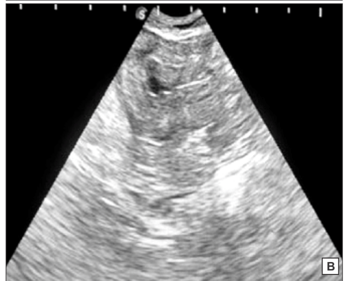
Fig. 3. Ultrasonographic Examination (a) Inguinal region showing anechoic sacculation of tubular structure (b) Abdomen revealing hypoechoic thickened uterine horn