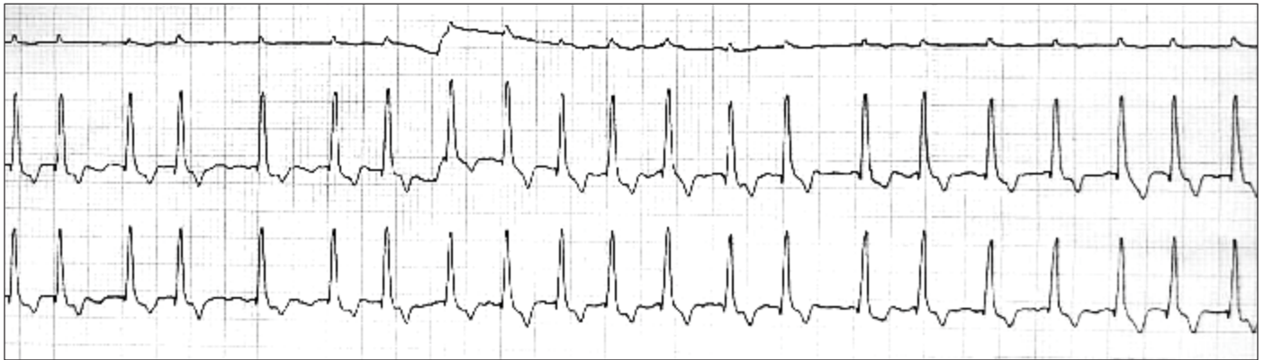
Fig. 1. ECG showing Atrial fibrillation with electrical alternans in a dog with DCM