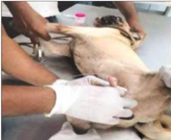
Fig. 1. Catheterisation of the bladder to collect urine