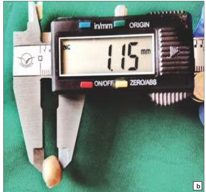
Fig. 1. (a) Length of ovary (b) Width of ovary recorded using digital vernier caliper