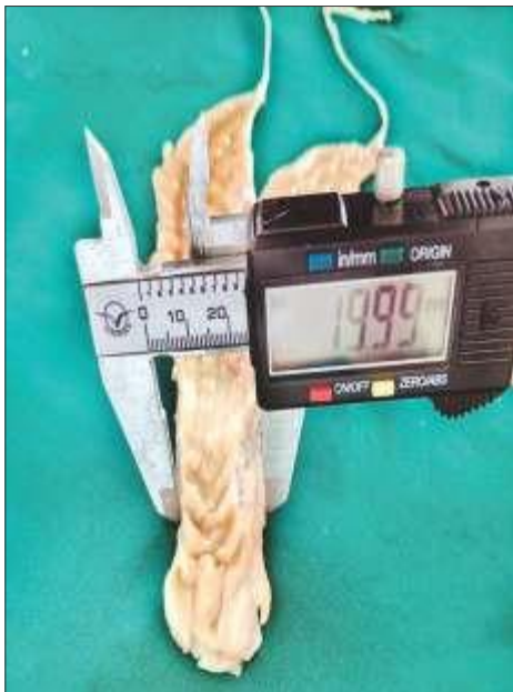
Fig. 5. Measuring the width of cervix

the connective tissues and vascularity that contribute to an increase in size of the CL (Islam et al. , 2007). The significant increase of width of ovary during luteal phase might be because of presence of corpora lutea along their surface (Saleem et al. , 2017).