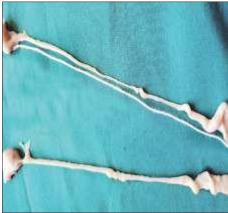
Fig. 2. Measuring the length of oviduct