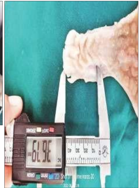
Fig. 4. Measuring the length of cervix