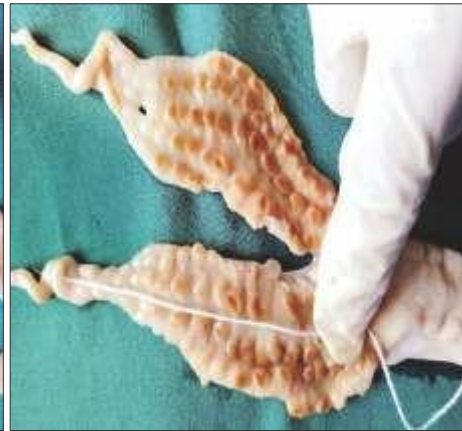
Fig. 3. Measuring the length of uterine horn