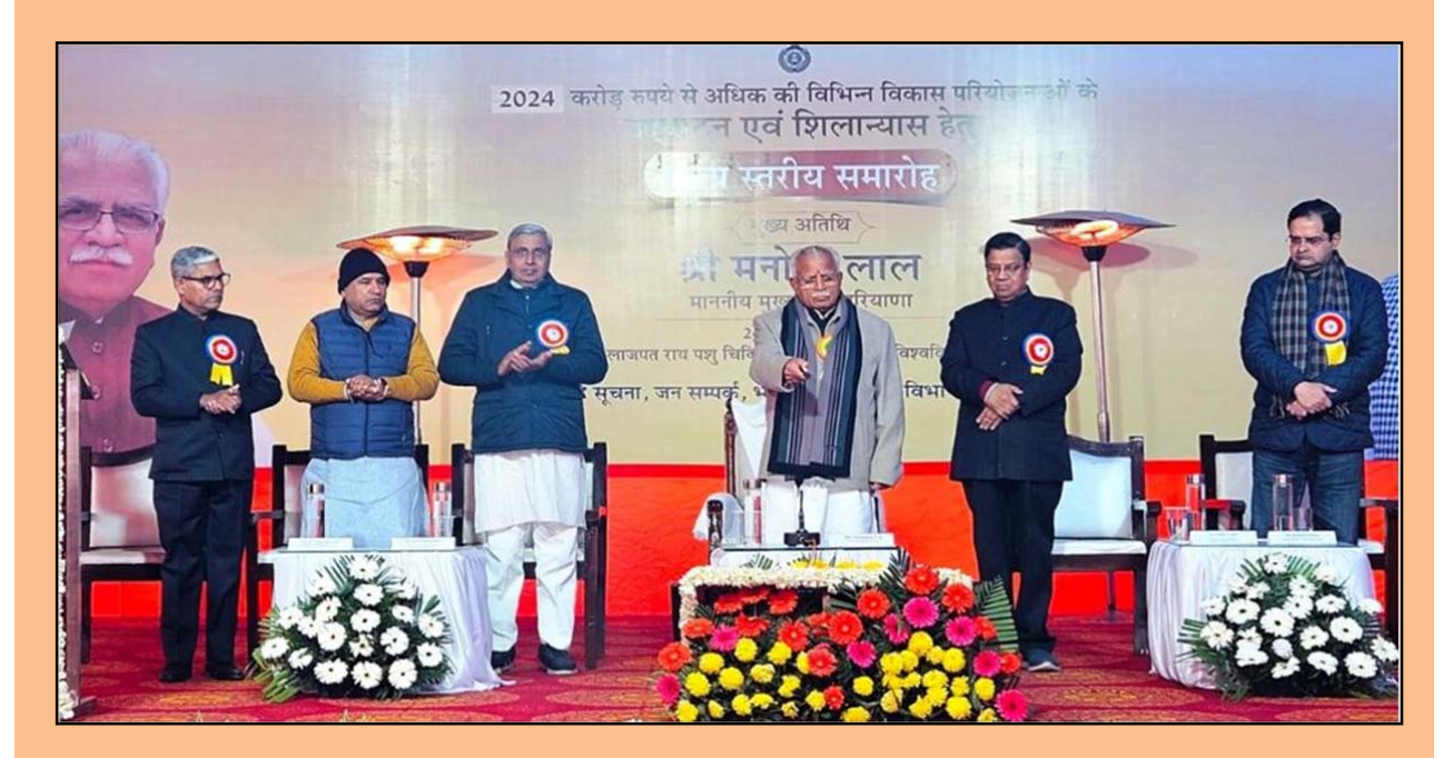
Inauguration of Vice-Chancellor's Secretariat-cum-Administrative Block of New Campus by the Hon'ble Chief Minister, Haryana