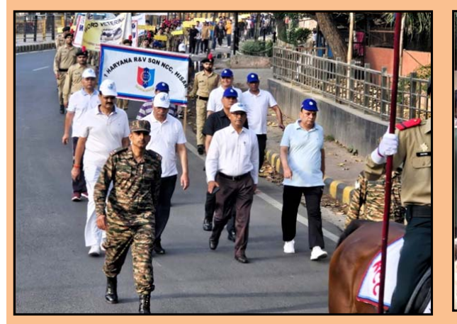
Vets March on World Veterinary Day