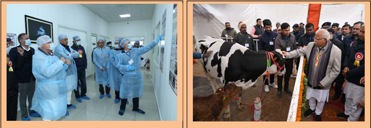
Hon'ble Chief Minister's visit to ETT-IVF Lab and Cattle Stall