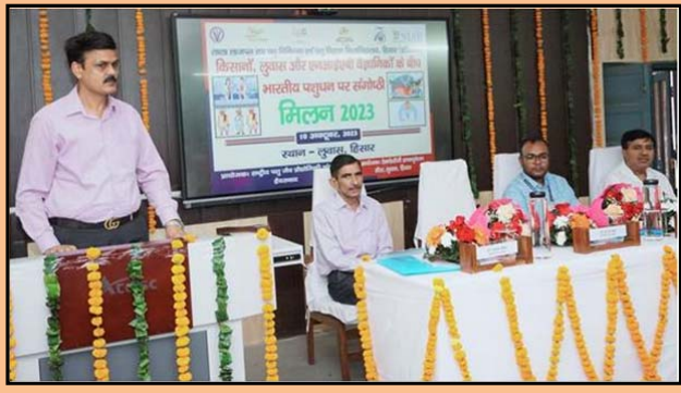
Seminar on Livestock Development (MILAN-2023)