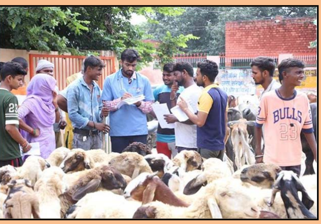
Clinical camp glimpse