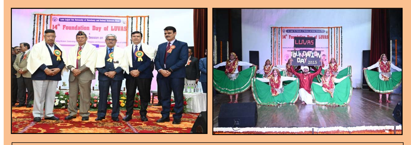
Glimpse of 14<sup>th</sup> Foundation Day of LUVAS, Hisar