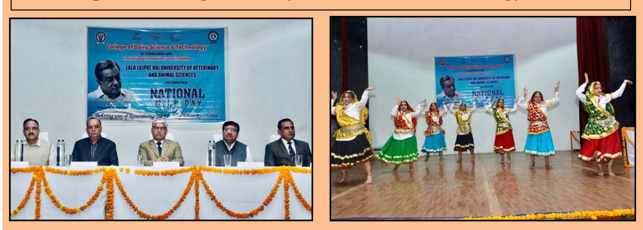
National Milk Day Function organized by LUVAS