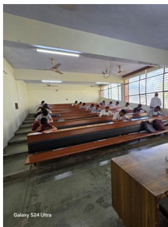
Students of IPVS, LUVAS participating in the quiz competition on the topic “Know your Constitution and Making of the Constitution”.