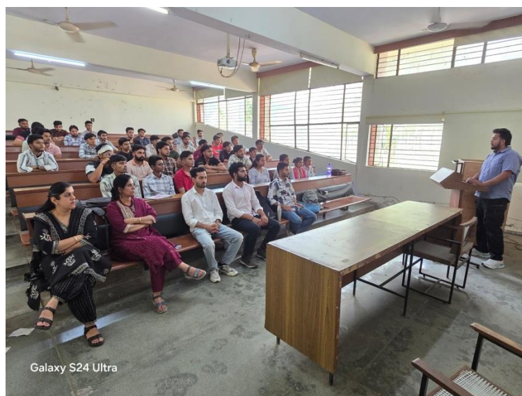
Students and teachers of IPVS, LUVAS participating in the seminar on “Rights and Duties of citizens and other constitutional issues.