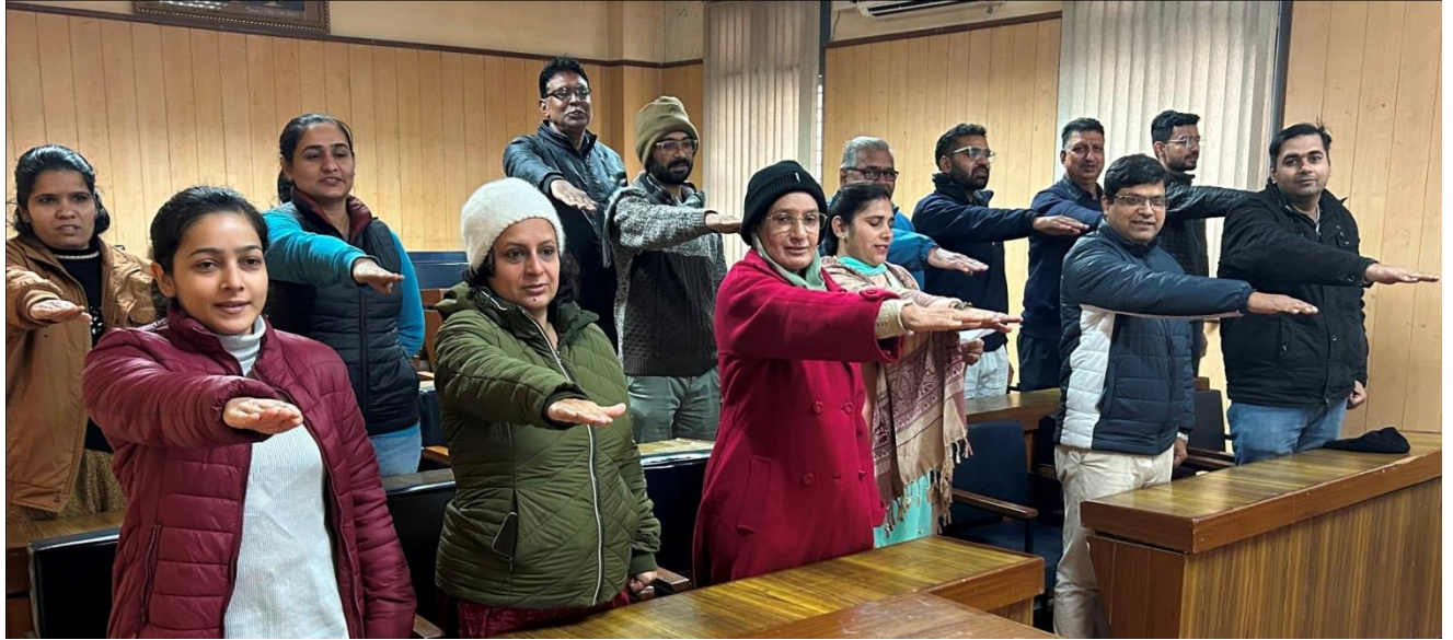
Teachers, students and non-teaching staff of COVS, LUVAS reading the Preamble of Constitution of India on 17 Jan, 2025.