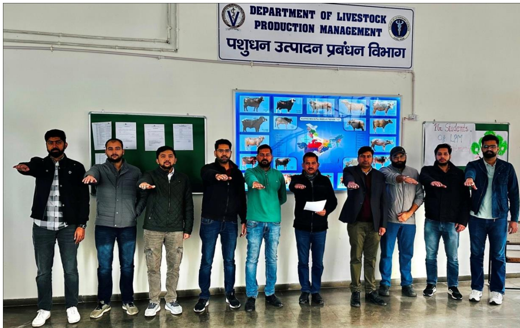
Teachers and students of COVS, LUVAS reading the Preamble of Constitution of India on 17 Jan, 2025.