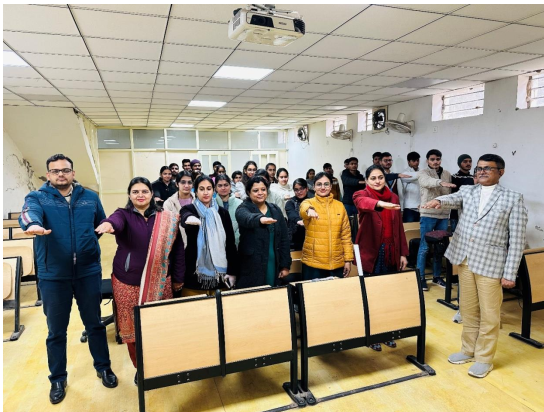
Preamble reading on 17th January 2025 to celebrate the anniversary of 75 years of the adoption of the constitution by the teachers and students of CODST, LUVAS.