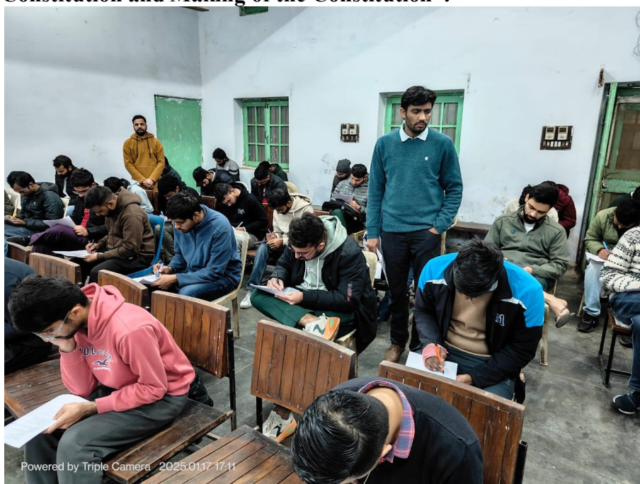
Students/residents of boys Hostels, LUVAS participating in the quiz competition on the topic “Know your Constitution and Making of the Constitution”.

To mark the 134 th birth anniversary of Dr. Bhimrao Ram Ambedkar, the principal architect of the Indian Constitution and a champion of social justice, College of Veterinary Sciences, Lala Lajpat Rai University of Veterinary Sciences (LUVAS), Hisar proudly celebrated his birthday in the theme of 75 years of adoption of Constitution on 16 th April 2025.