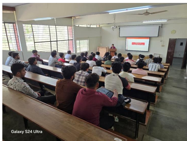
Faculty members and students of IPVS, LUVAS participating in the seminar on “Rights and Duties of citizens and other constitutional issues.