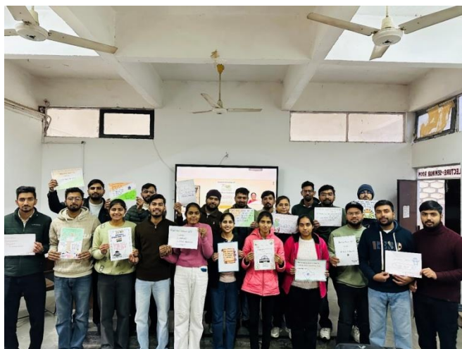
Students of CODST, LUVAS portraying their slogans about “Constitution of India”.

A total number of 53 students of IPVS, LUVAS, Hisar participated in activities through the campaign websites and got online certificates. Some of them are as below: