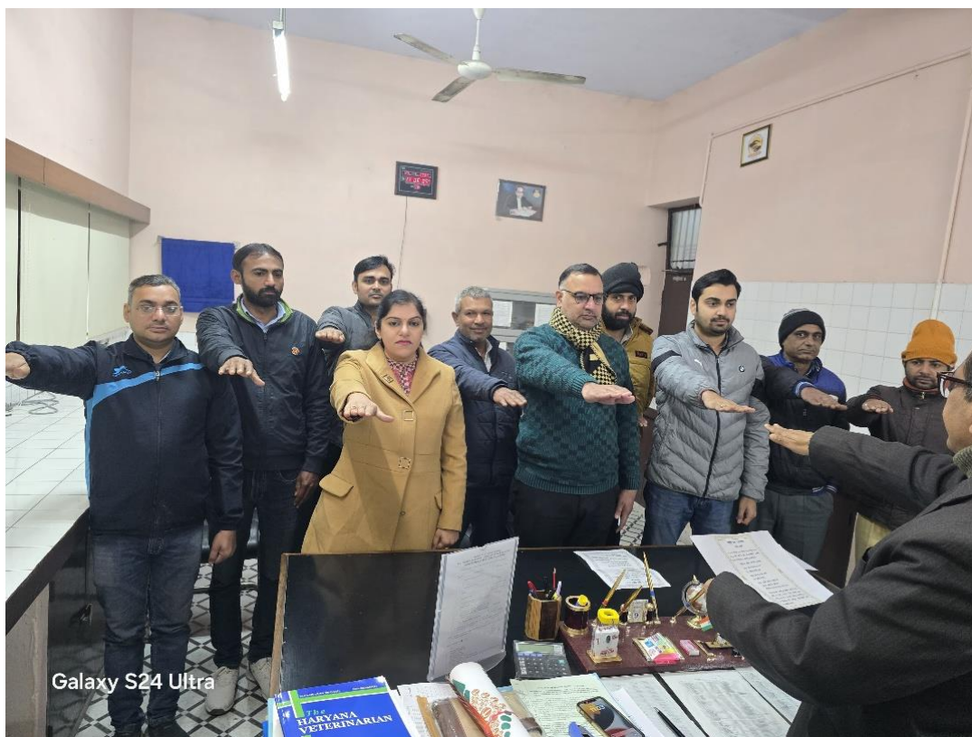
Preamble reading on 17th January 2025 to celebrate the anniversary of 75 years of the adoption of the constitution by the teachers and nonteaching staff of Director IPVS, LUVAS, Hisar