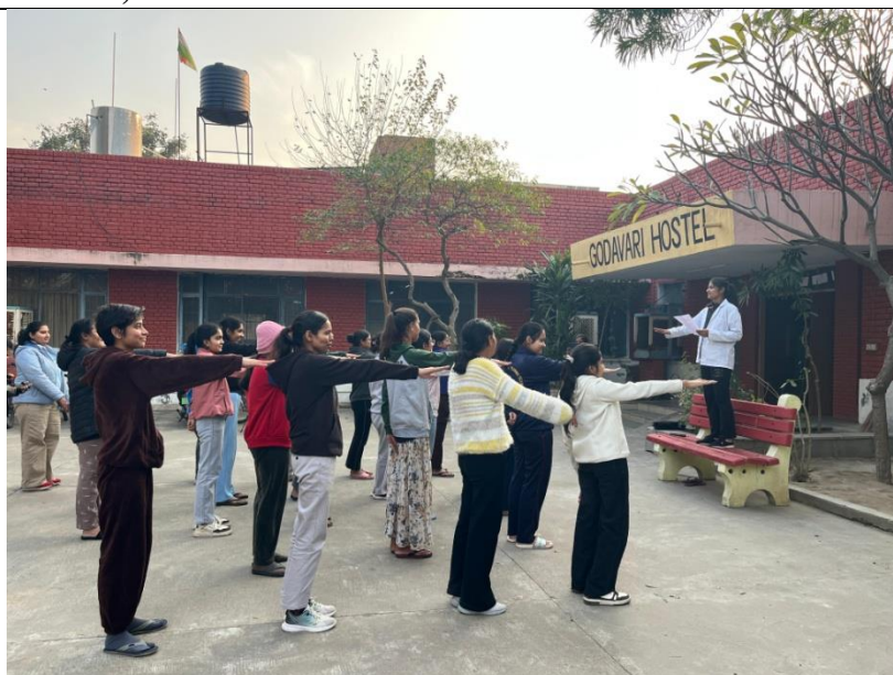
Preamble reading by the hostel residents (Girls) of LUVAS on 17th January 2025 to celebrate the anniversary of 75 years of the adoption of the constitution.