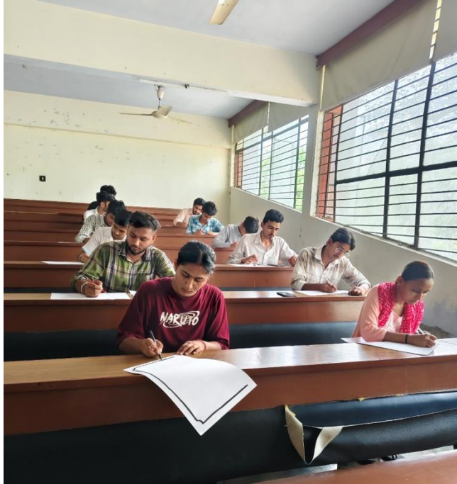
Students of IPVS, LUVAS participating in the calligraphy competition on the topic “Issues of Promoting Gender Equality”.