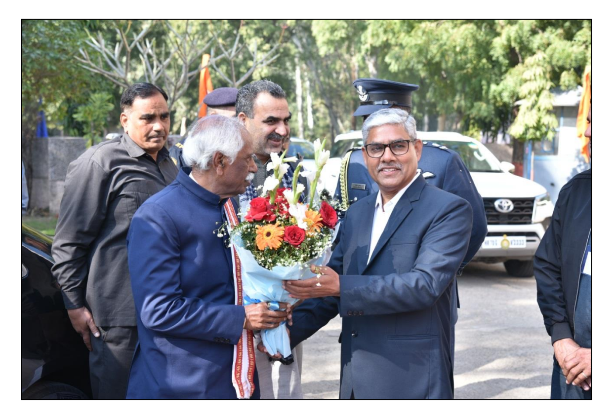
Worthy Vice-Chancellor welcoming Honorable Chancellor at LUVAS