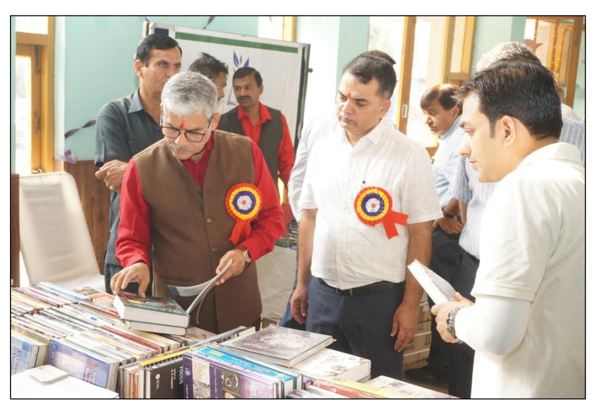
Worthy Vice-Chancellor at Book Exhibition of LUVAS