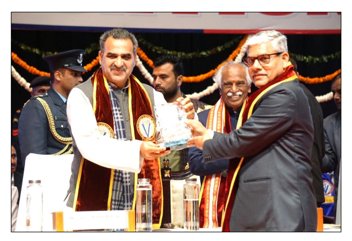
Welcome of Honorable Minister of State (Union of India) - Fisheries, Animal Husbandry and Dairying by Worthy Vice-Chancellor at LUVAS