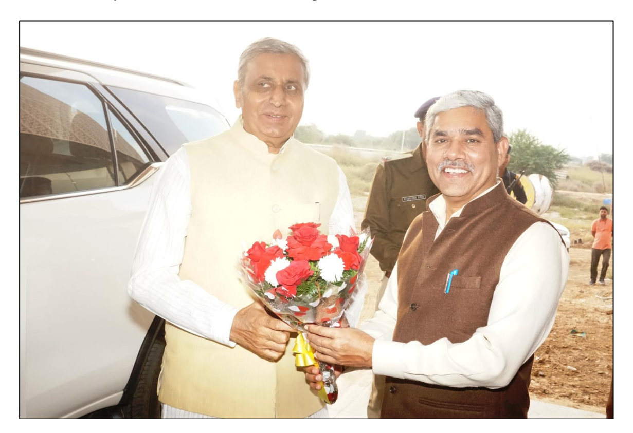
Welcome of Honorable Animal Husbandry Minister, Haryana by Worthy Vice-Chancellor on his visit to New Campus of LUVAS