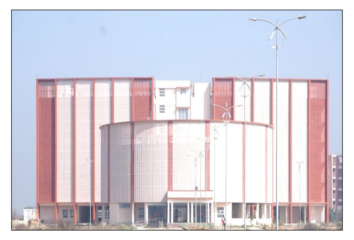
Administrative Block, New Campus, LUVAS